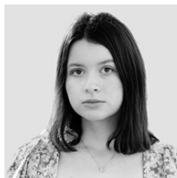
Liv Queen Majestic